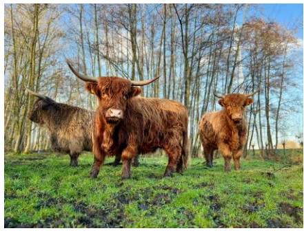
Highland cows used for natural grazing in Diemen.

Vattenfall has generation assets in locations where we are close to protected areas and where we collaborate with local stakeholders to perform conservation actions. In Diemen,