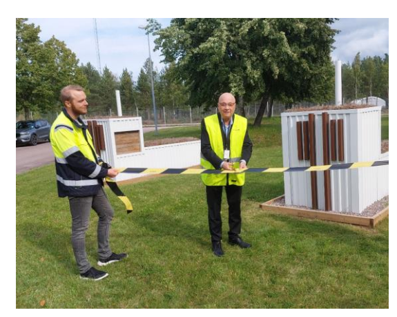
Inauguration of bee hotels in 2023.

In 2024, the industrial area will be surveyed for pollinating insects for the second time. This is exciting and will provide indications of whether our measures and changed routines have had the desired effect and led to more species thriving in the area. Other measures are planned for the year as well, measures such as to cut trees and create high stumps, as well as to fill the fauna depots with more material. New managing routines will be continued, but may change given the outcome of inventory in order to improve the management. This initiative is a part of our