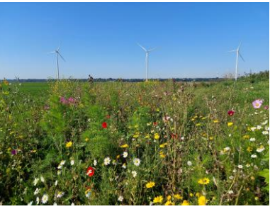
Some of this land, including the service center area, has been repurposed for biodiversity improvement. In total 4 hectares of land was turned into flower rich

Since the second half of 2022 efforts has been made to improve the biodiversity at the Princess Ariane Windfarm (Wieringermeer). Located in the agricultural north-west area of the Netherlands, the windfarm has 50 Vattenfall owned and 32 Vattenfall maintained WTGs in its portfolio. Large amounts of agricultural lands can no longer be used for their original purpose due to land use restrictions caused by the turbines and their cables.