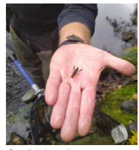
Crayfish juvenile.

A successful reintroduction of species is dependent on that suitable habitats are available or could be restored. In the southwest of Sweden we have had two projects to improve the situation for the acutely endangered Noble Crayfish. Measures are carried out to improve survival of juvenile crayfish by restoring and creating new habitats in the watercourses. During 2022 reintroduction of 7300 crayfish juvenile and 1-3 year old noble crayfish were performed in these restored areas.