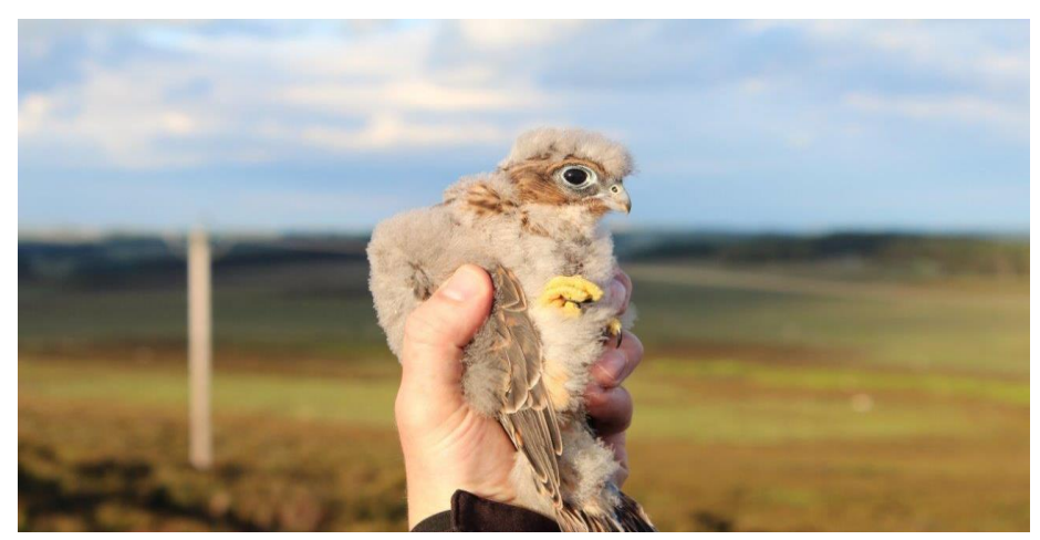
A merlin chick at Ray Wind Farm.