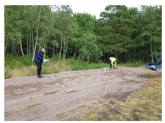
Sandbank being created at Forsmark.

An evaluation of suitable habitats for enhancing diversity of pollinating species on Forsmark's industrial site were completed in 2021, and in total nine different areas were proposed for implementing measures. In 2022, nesting habitats for pollinating insects were constructed, two fauna depots and a large sandbank with plug plants in the industrial area.