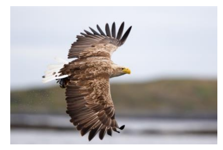
White-tailed eagle.

With the purpose of exploring the possibilities to develop and operate wind farms in an area with presence of eagles, Vattenfall has been involved