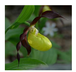
Lady's slipper orchid

We protect rare and endangered species in several voluntary protected areas. Voluntary protected areas are sites with very high, and sometimes unique, biodiversity values. Through this voluntary initiative we preserve and manage biodiversity, but we also enhance recreation values and inform the public about the values in the different locations. In our protected areas we have species like the fairy slipper, moonwort, the lady's slipper and witches cauldron. We have four areas in northern Sweden located along the Lule River. We also have one protected area located along the river Dalälven called "Kungsådran Älvkarleby. The area was chosen by Vattenfall because of its unique combination of calcareous soil that gives rise to