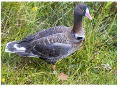
Lesser white-fronted goose.

The areas where Vattenfall has many of its hydro operations, are home to EU's only breeding population of the lesser white-fronted goose. For 2021–2022, Vattenfall supported the Swedish conservation project for lesser white-fronted goose by sponsoring specially designed transmitters used to follow the individual geese that have been raised in captivity and released in the wild. The transmitters are charged by solar cells. Movement mapping is a very important piece in evaluating the effectiveness that the measures have on the population. The project is led by the Swedish