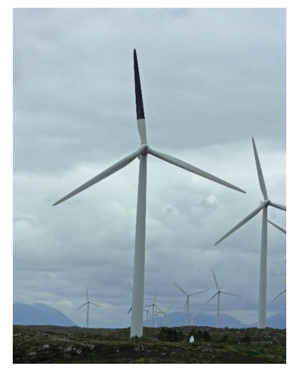
Rotor blade painted black, Smøla.

Vattenfall have invested both in studies to improve the evidence base on collisions risk (e.g., as described in 2.6), allowing for more realistic predictions for new wind farms, and in studies to test potential measures to reduce collision risk without restricting the operation of turbines.