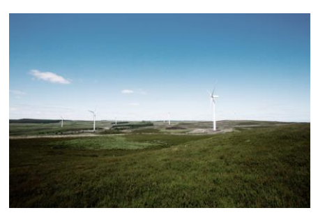
Ray Wind Farm.

Following construction of the wind farm, a range of operational monitoring measures have been undertaken to ensure that the ecological sensitivities present within the site are being maintained and enhanced