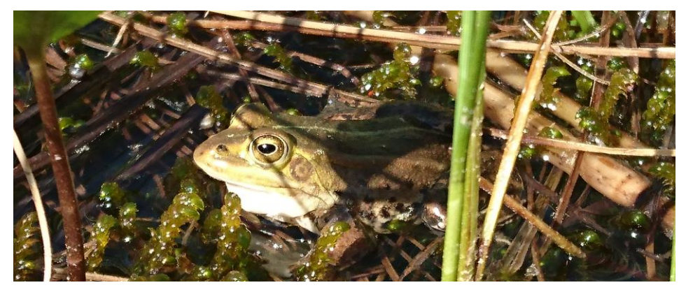
A pool frog.

SKB's annual inventories show that the pool frogs have found the new ponds. During the spring of 2023, frogs amphibians from the pond which is to be filled in were caught and removed to the new ponds. Fifty pool frogs and 240 great crested newts were relocated this first year and the project will continue during coming years