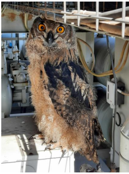
Young owl at Krümmel nuclear power plant, Germany.

Vattenfall has created a user-friendly app accessible to all employees, allowing them to share photos and videos of nature at diverse locations throughout the company's operations, with the primary goal of enhancing environmental consciousness, advancing scientific knowledge, and promoting environmental protection. Moreover, the app enabled employees to participate in Vattenfall's first joint Nature Photography Contest 2023, with an internal jury selecting the best images for display at an office exhibition across several European offices. The winner of the competition is this photo of a young owl. It was captured at Krümmel nuclear power plant in Germany which has been closed down since 2011. The owl used the roof as an occasional roost.